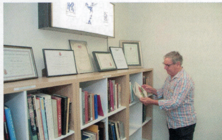
above: Queensland members can inspect the publications in the QLD Archive Library.